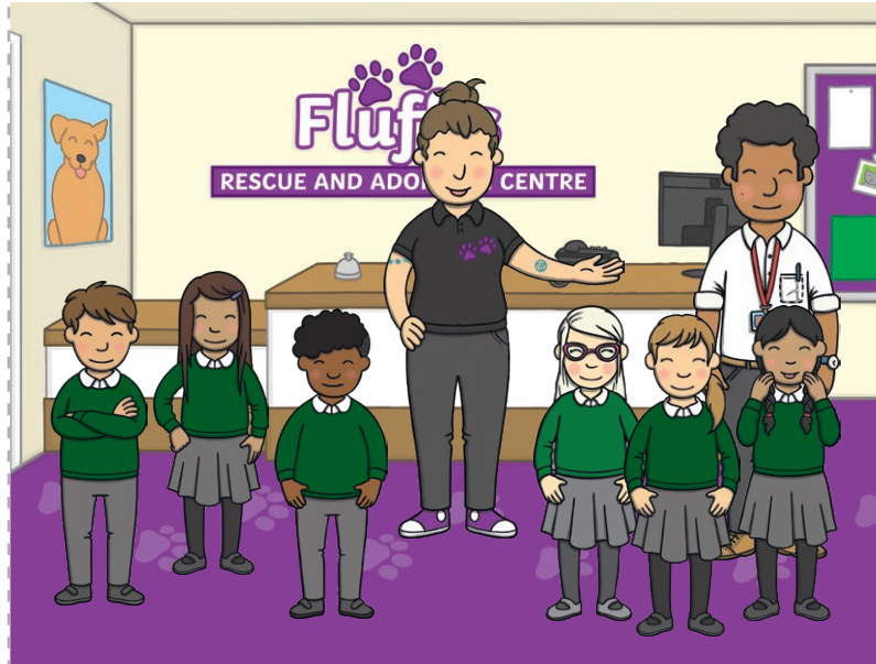
A 'Let's Read Together!' Book