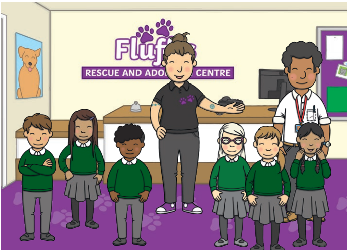
Fluff's Animal Rescue